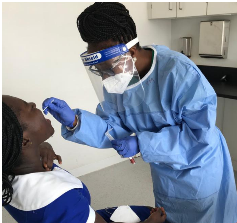
Study staff in full PPE collecting a throat swab from a nurse at Greater Accra Regional Hospital

In response to these challenges, Yemaachi, in collaboration with the West African Centre for Cell Biology of Infectious Pathogens (WACCBIP) of the University of Ghana, secured a grant from Google to leverage our expertise in Next Generation Sequencing (NGS) and bioinformatics to provide detailed characterization of SARS-CoV-2 in Ghana.